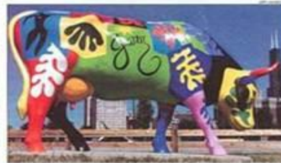
The Statue inspired Jai Cen is one of 200 works on display in downtown Chicago.