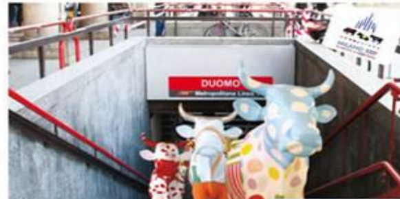
cowparade 2007 La più grande mostra d'arte contemporanea a