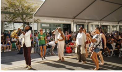
Jazz & Food Festival